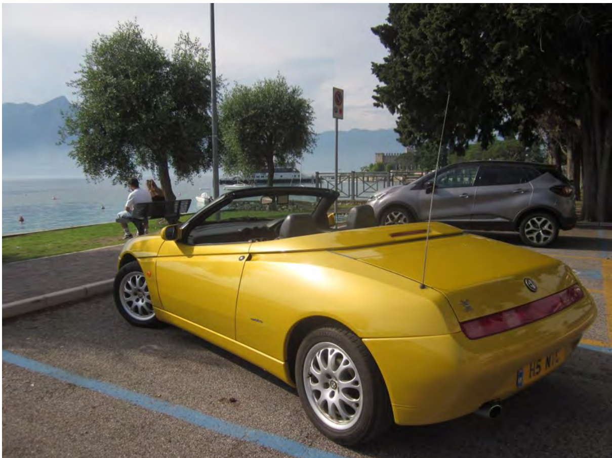
LARGO DEL GARDA.

May 21–24. We are in our happy place. Bardolino is such a pleasant town to stay. We walk, use the lake boats, tour the lakeside towns...yes... posing in the car with the hood down, visit Valpolicella to get some Rippasso, and basically, enjoy our holiday.