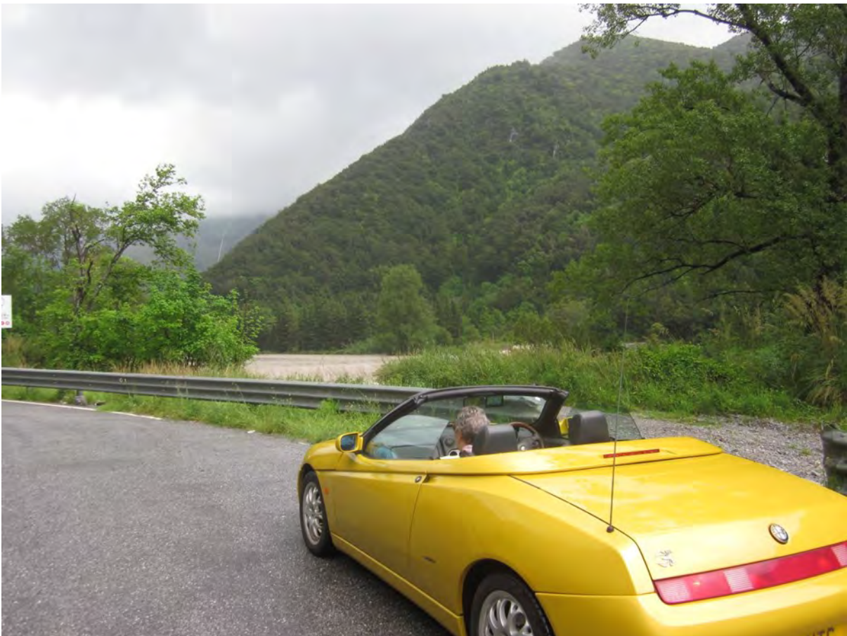
GOOD MOUNTAIN ROADS, WHAT THE CAR WAS MADE FOR.

May 17. Hell of a storm again last night. Termoli today and on to coast roads for a while then we swing into the mountains to cross to the Adriatic. Some of the best mountain views this trip but then the heavens opened up again. 1 1/2 hours later we stopped for a coffee and a bun and watched the sun come out. Hood down and we motored on good roads with minimal traffic and not to many potholes. Heaps to see in the mountains including more golden eagles but the views are stunning. Termoli is a nice town with resort beach, castle and good shops. Pizza and a beer were very welcome.