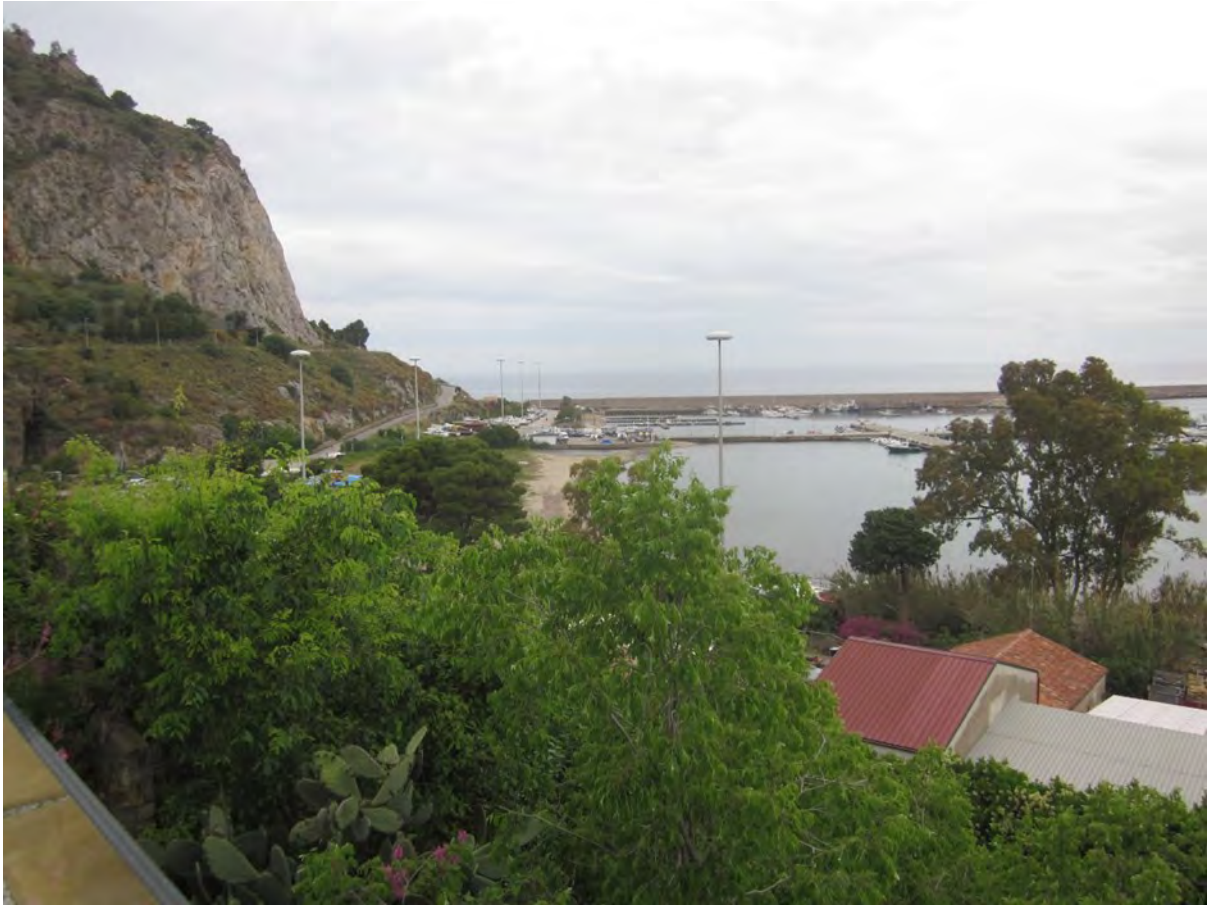
VIEWS FROM THE B&B, CEFALU.

Stunning views of mountains and twisty roads, just what we came for. We have plenty of time but we are held up a little by a 4x4 with the driver leaning out of the window leading 5 horses to his farm and then by a herd of cows being driven along the road...big ones...with horns... big horns! Brilliant day with excellent weather and quiet roads. We get to our accommodation in Ponta Secca with time for drinks... Nice. (This is where TV show 'Inspector Montalbano' is filmed.). Sleepy little place and a two night stop so quiet time tomorrow. (May 12.)