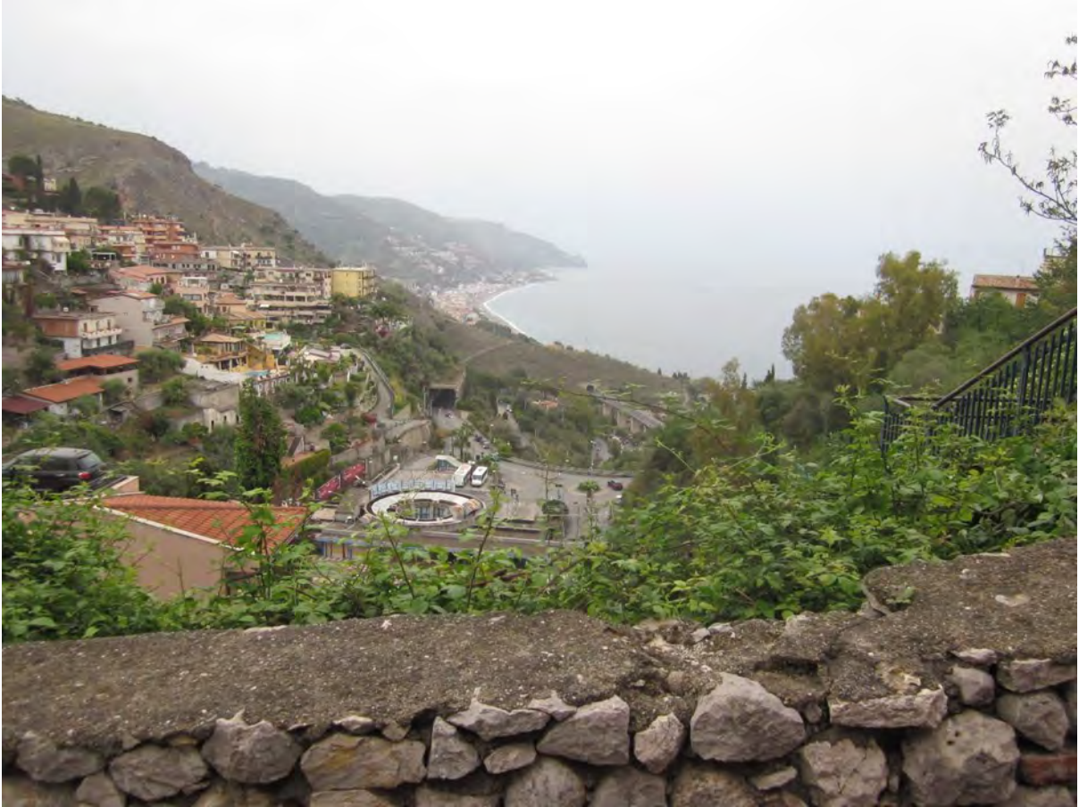
TAORMINA IS STEEP.

May 14. Off to Messina after a lazy morning in town, drinking coffee and seeing the sites. The car is manky so we found a carwash and blasted the desert from all the nooks and crannies. Very pleasant roads along the coast with stunning views along the way. The apartment in Messina doesn't have parking but we got in just opposite. Good long walk before dinner, early start tomorrow for ferry back to the mainland.