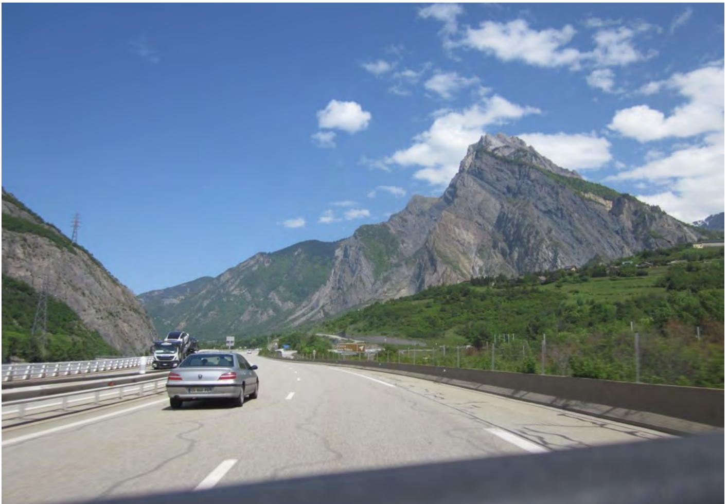
ALPS IN THE SUN

May 2. We blasted down the French motorways on our way to our next stop at Chambray. It took most of the day, but, although the tolls are expensive, the roads are mostly good with only light traffic until Lyon and the scenery is really nice. However. The French do seem to have the same deal with Beelzebub when it comes to the dreaded cones though. Miles of the things and not one navy leaning on a shovel to be seen.