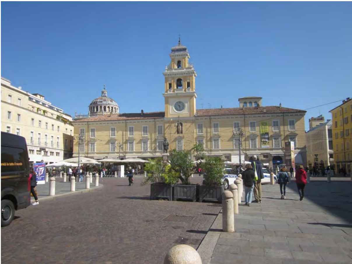
PALMA MAIN SQUARE

May 3. More motorway driving and through the Frejus tunnel into Italy the next day. Wonderful views of snow-capped mountains and even a Golden Eagle!! E5 petrol was Euro 2 a litre in France and down to Euro 1'75 in Italy. With great weather we dropped the hood to get started on my tan and pushed on to Parma. Heaps of roadworks both sides of the boarder but we got into Parma mid-afternoon ready for snax and drinkipooos. Here for two nights so we explored and met some lovely people. Great food and company, great place to chill. Parma is very pretty with some lovely sight to see, Italian food at its best and the Rippaso is outstanding. We'll be back.