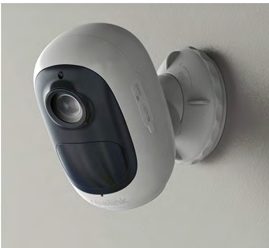
Example Reolink battery powered camera with 2 way audio and siren ( wifi model )

CCTV for your house and garage has come a long way in the last 10 years. The cameras are much more intelligent about recognising when cars or people move within the area of view. If you have house fed power to your garage, you can almost certainly fit CCTV cameras that will constantly monitor the garage inside and out. Cameras can be configured to alert your phone when there is a movement within your garage. Unlike traditional alarm systems an ongoing subscription is not required as monitoring and alerting is done directly to your mobile phone. For garages beyond the reach of power and Wi-Fi self sufficient cameras are available that will send the pictures home via a mobile phone signal. Some charges would apply in this case. Separate boxes for recording are also redundant as cameras can store recordings of interest on an included memory chip. The modern camera types are no longer just a passive recording or scanning devices and are available with two way audio and siren trigger. Typically, the price for a powered network enabled camera is about £70.