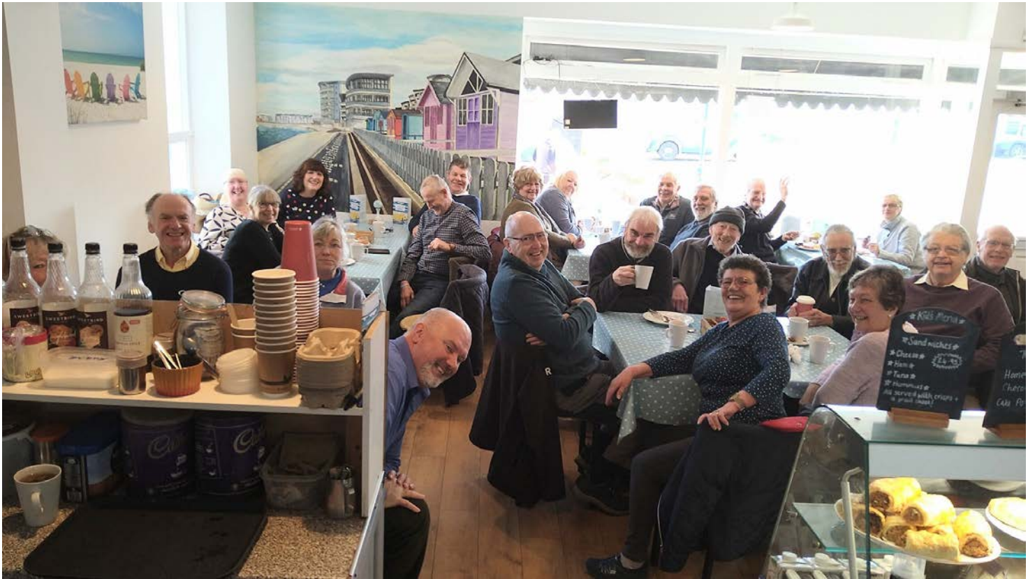
Fine weather helped ensure a good turn out of 30+ members for the February breakfast meet at the Slice of Life Café. Westward Ho!